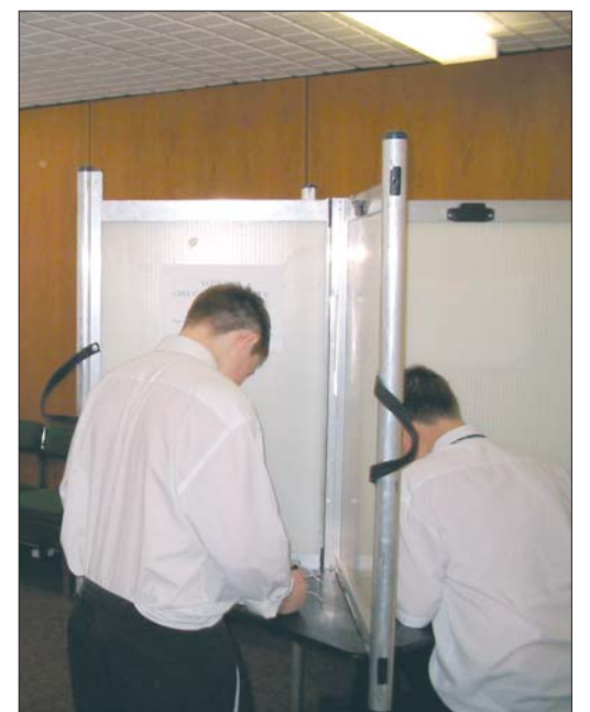
Students voting in a specially created polling station during Local Democracy Week

For further information contact David Coghill on 01902 696704 or e-mail d.coghill@sstaffs.gov.uk .