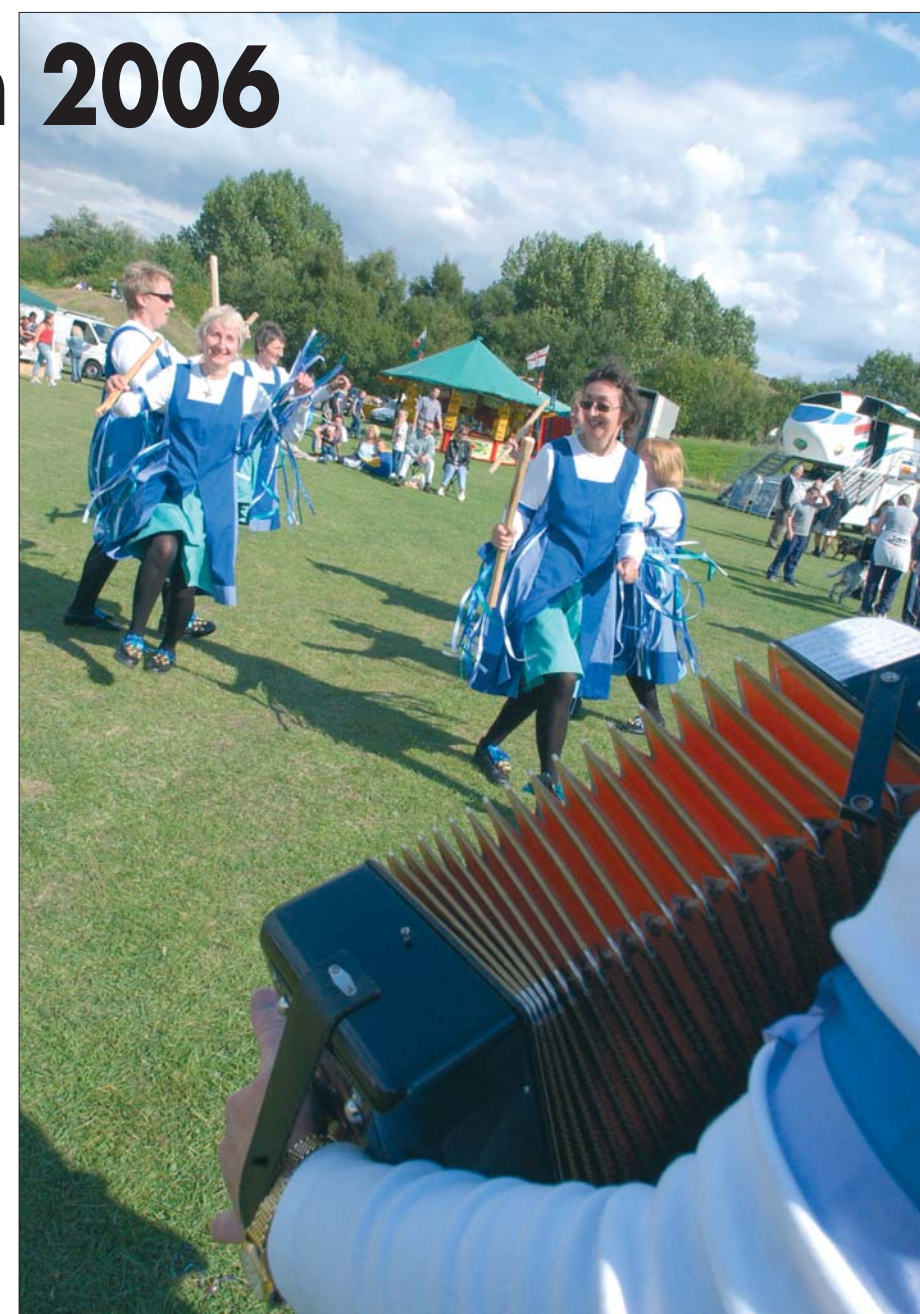
Morris Dancers at the Folk Festival