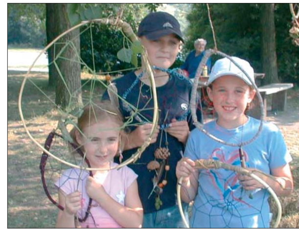
Summer SUSSED Children's Activities

Details on all the events are either available online at www.sstaffs.gov.uk/baggeridge or by contacting Community Services on 01902 696531.