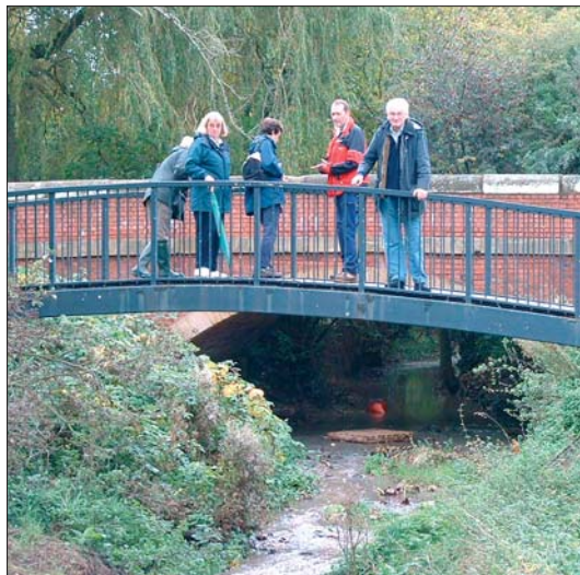
Members of the Friends Group - observing the Wom Brook

Even if you are not able to join in various projects, your awareness of what is going on (to pass on to others) will be just as valuable.