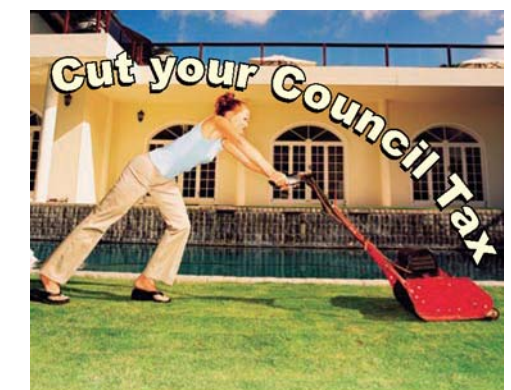
Find out if you can get a rebate

You can also get information from your local Jobcentre Plus, Jobcentre, social security office, or from The Pensions Service, or you can visit the the Department for Work and Pensions (DWP) website at www.dwp.gov.uk