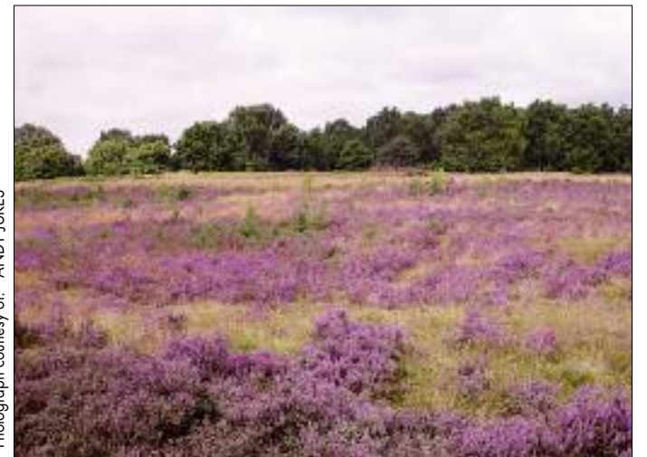
Swathes of heather carpet Highgate Common during the summer months.

For more information on Staffordshire Wildlife Trust and how you can become a member, call 01889 880100 or e-mail: info@staffs-wildlife.co.uk