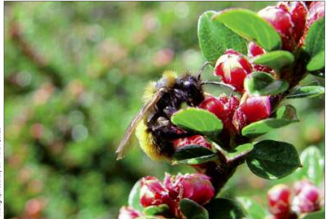
A Tawny Mining Bee - one of the many bee species you may see during a visit.

One of the Common's most attractive residents is the tawny mining bee, a large, fluffy, ginger red bee. Unlike the honey bee, it is a solitary bee, which means that rather than living socially in hives, it makes its own nest by tunnelling into the ground. This is one of the reasons it likes Highgate, because of the sandy areas which are easy for it to tunnel into.