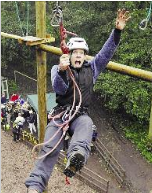
Baggeridge Aerial Ropes Adventure.

Request your FREE copy today either on-line at www.sstaffs.gov.uk/brochure or telephone South Staffordshire Council on 01902 696233 .