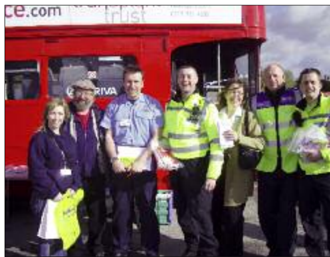
Raising awareness through the bus campaign.

Also, the team joined in with the National Burglary Day of Action. The aim of the day was to raise awareness of police enforcement work, offer reassurance to burglary victims, provide crime prevention advice and inform the public about the work of their local Neighbourhood Policing team.