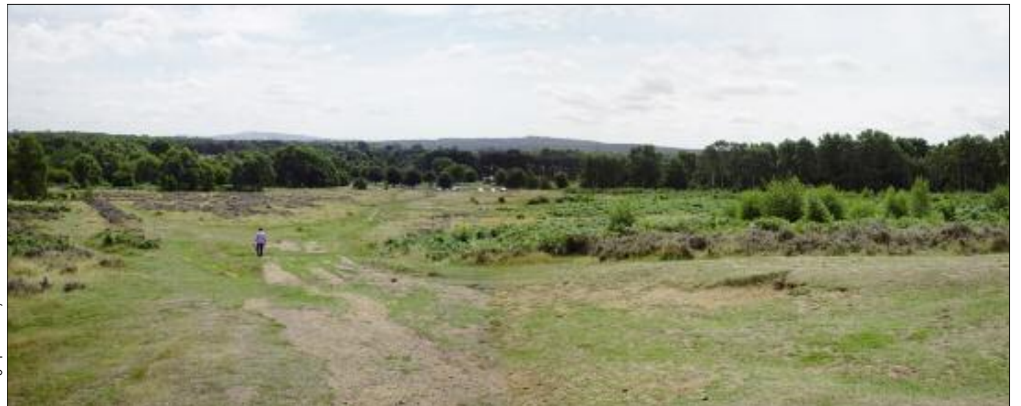
A panoramic view of Highgate Common showing sandy areas favoured by mining bees.