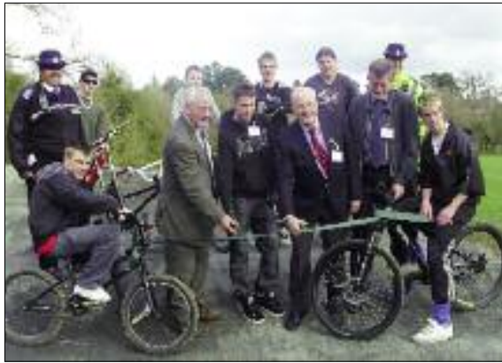
The opening of the Kinver BMX Bike track.

For further information on Playbuilder, you can also visit Staffordshire County Council's website: www.staffordshire.gov.uk/play