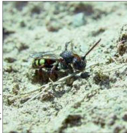
A Cuckoo Bee.