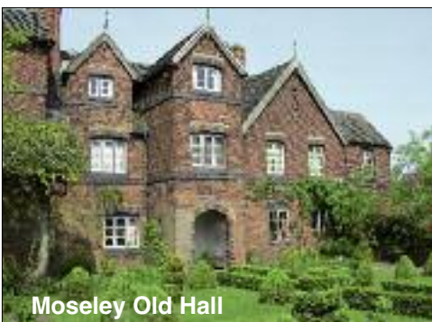
Moseley Old Hall

And without the help of his supporters in South Staffordshire, Charles would probably never have ascended to his throne!