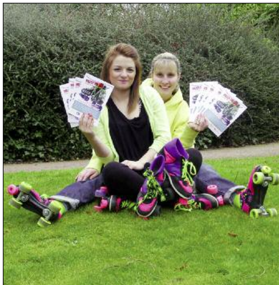
Children's Roller Skating Club launched at Cheslyn Hay Leisure Centre.

Roller skating sessions are up and running at Cheslyn Hay Leisure Centre.