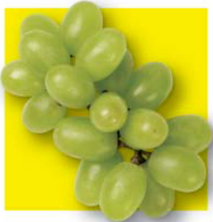
1 handful of grapes