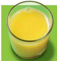
1 medium glass of orange juice