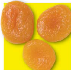
3 whole dried apricots