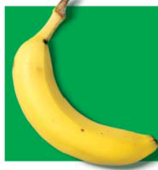
1 medium banana