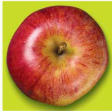
1 medium apple

The following is available as an A4 poster.