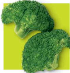
2 broccoli florets