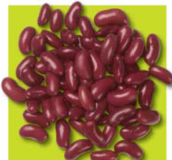
3 heaped tablespoons of cooked kidney beans