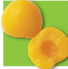
2 halves of canned peaches