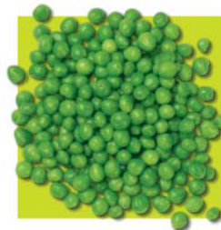
3 heaped tablespoons of peas