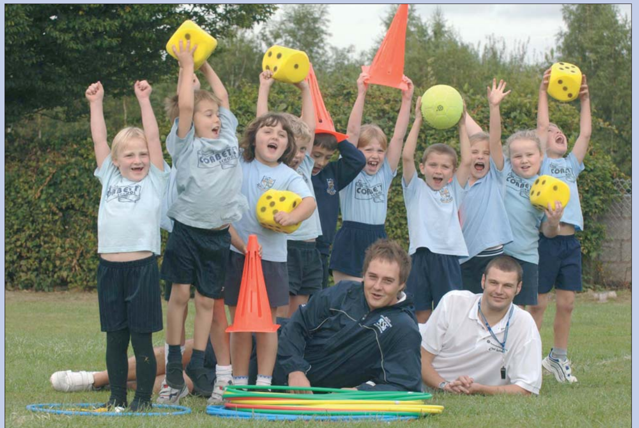
Community Sports Coaches working with children at Corbett Primary School