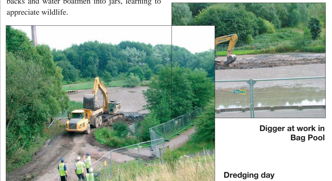
Digger at work in Bag Pool

By spring next year everything should be ready for all those children and their nets!