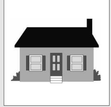
Home Visits (disabled, vulnerable and housebound)

We can offer this service in other languages: